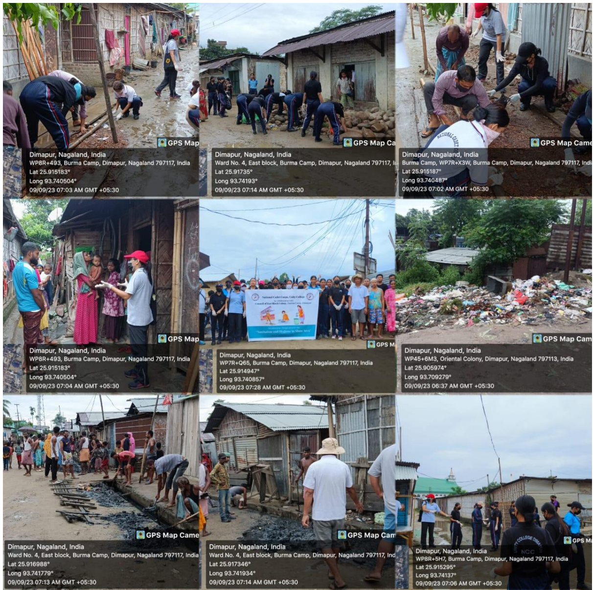
NCC successfully organised an awareness program on “Sanitation and Hygiene in Slum Area” in collaboration with the Council of East Block Colony Burma Camp, Dimapur (9 th September 2023).