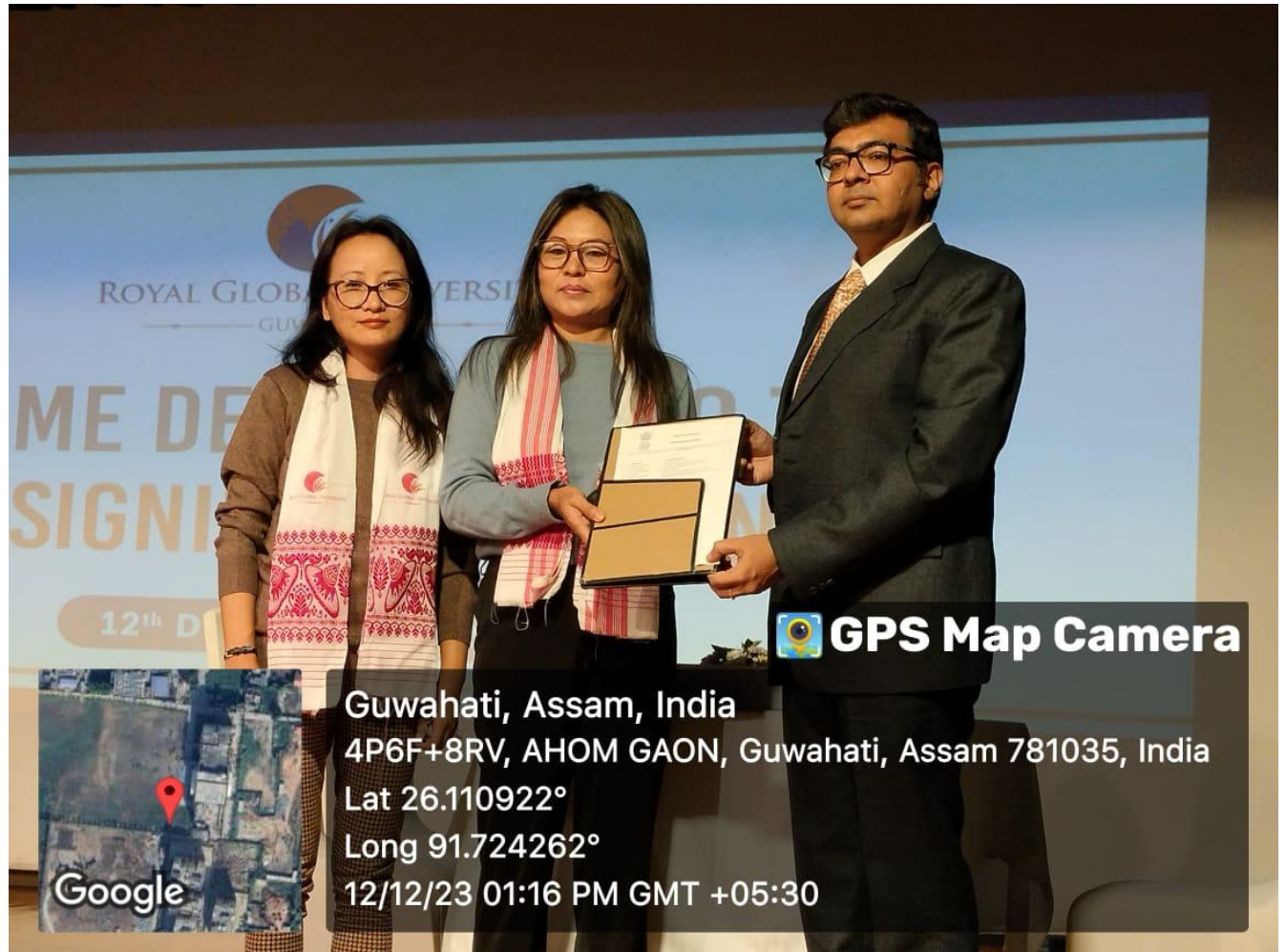
MoU with Royal Global University, Guwahati, Assam.