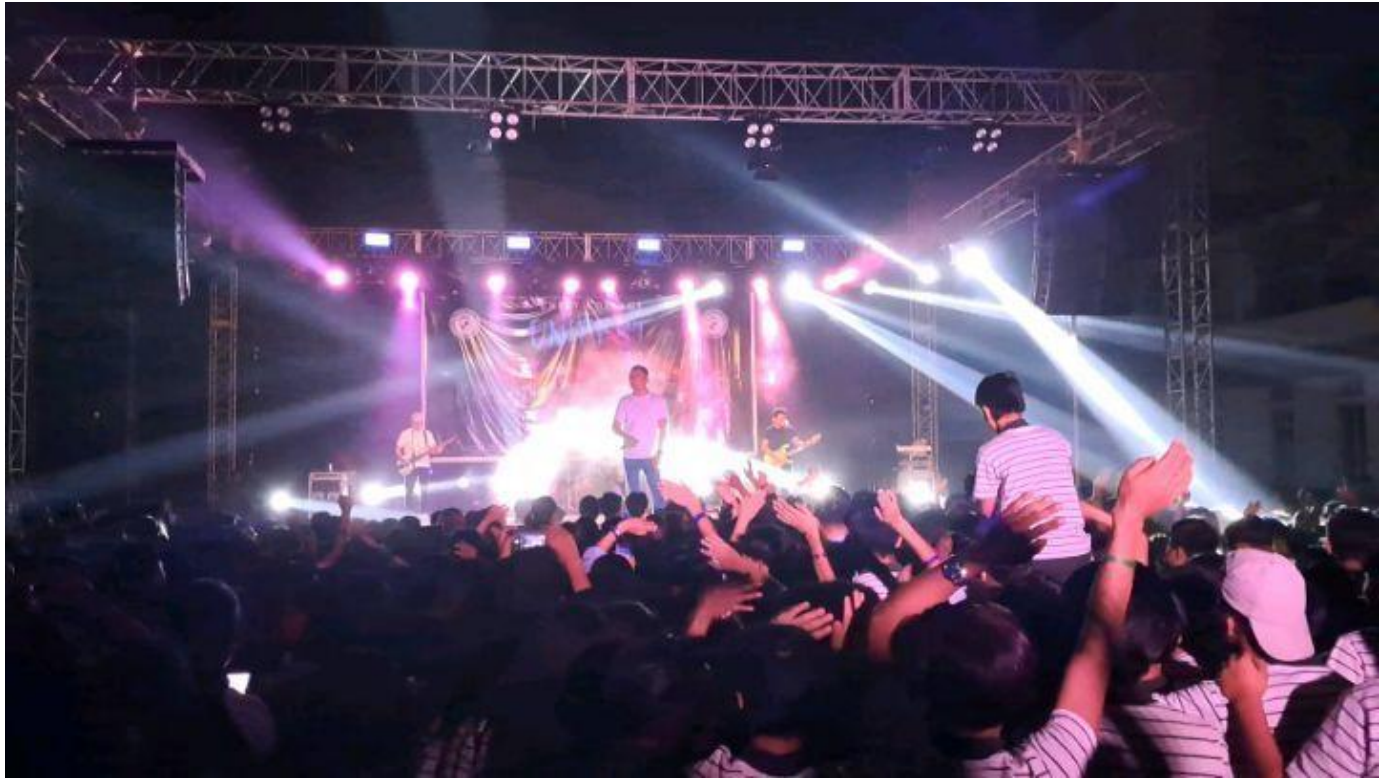
Unifest 3.0 (7 th -8 th March, 2024)