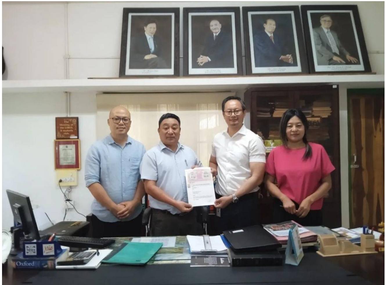
MoU with Patkai Christian College, Seithekema-Chumukedima.