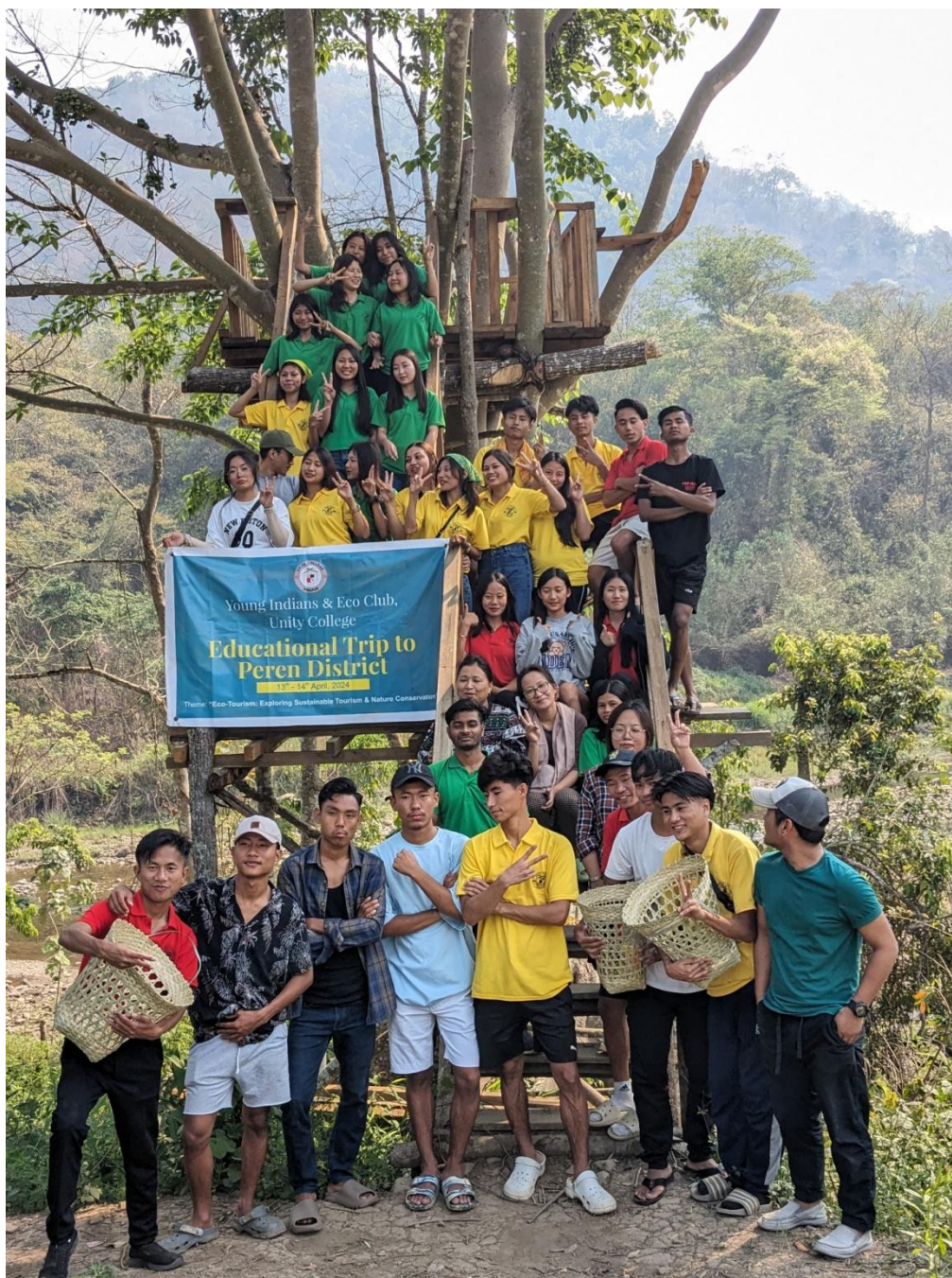
Young Indians and Eco Club jointly organised an Educational Trip to Peren District, under the theme " Eco-Tourism: Exploring Sustainable Tourism & Nature Conservation" (13th -14th April 2024).