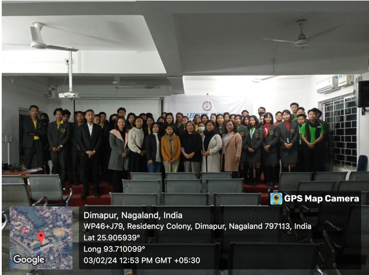
The Department of Education organised its first lecture series on the theme “Navigating the Future of Education: Innovations, Challenges and Opportunities” on 3 rd February 2024.