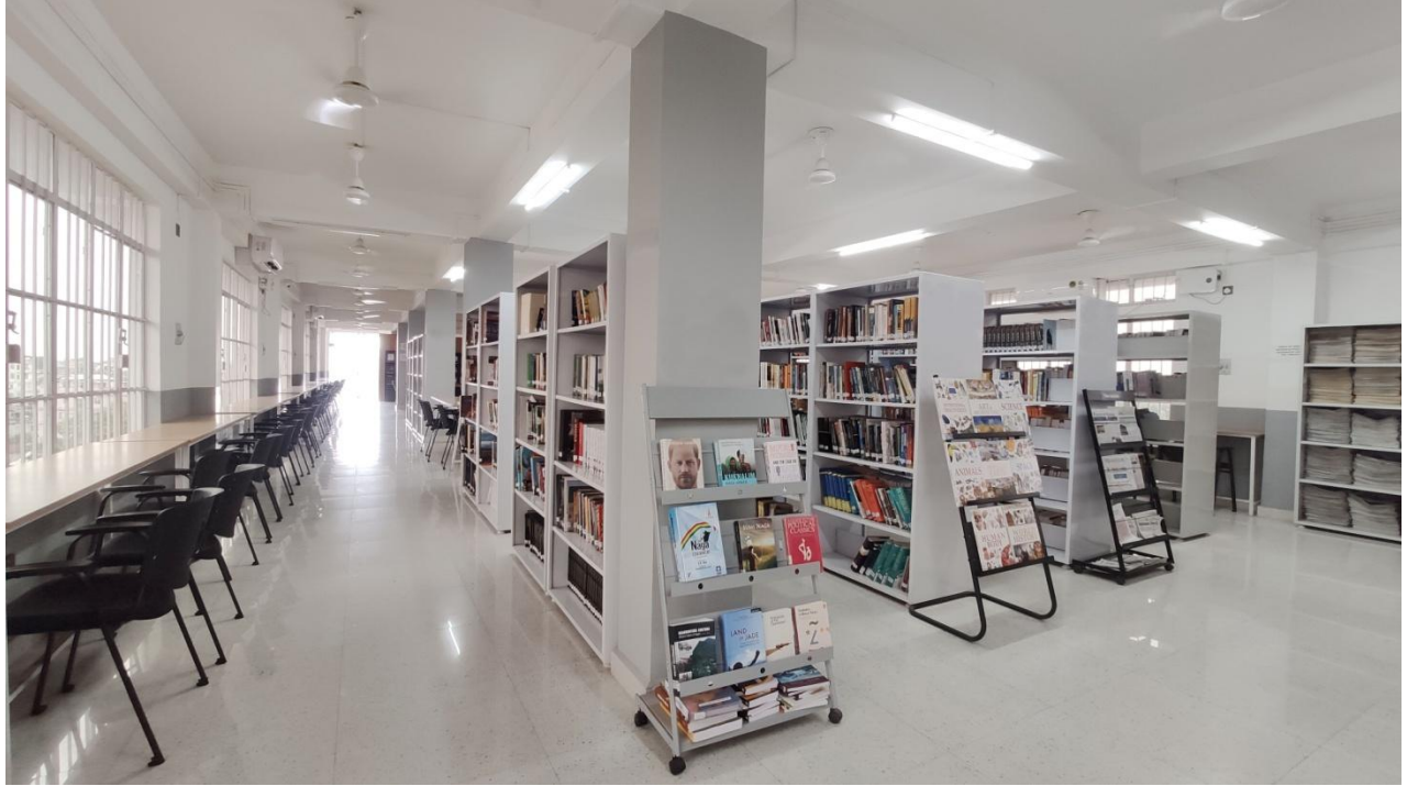
Unity College Library