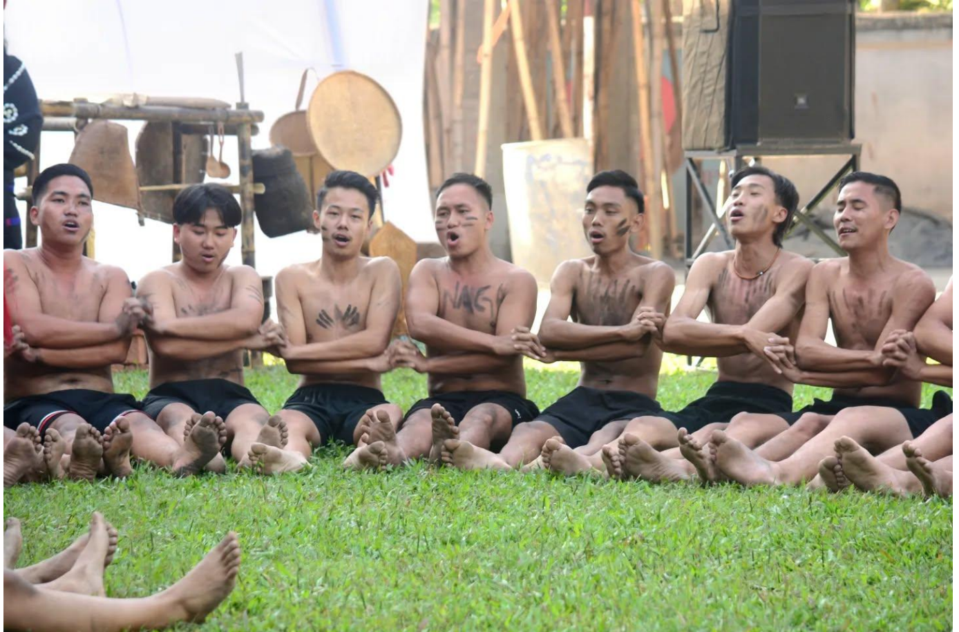
Cultural Day: Folk Dance (14 th November 2023)