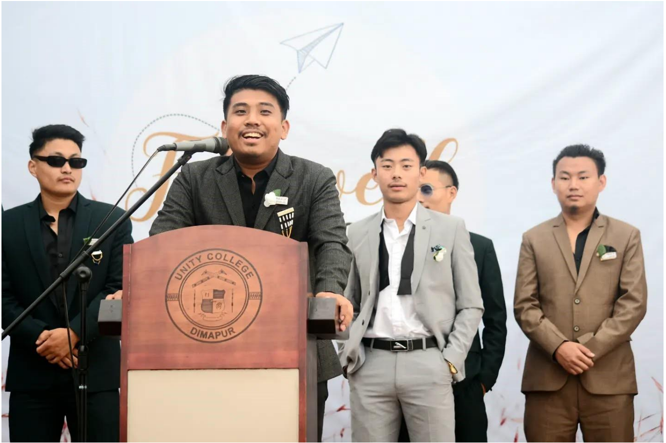
Farewell Program of BA/BCom 6th Semester (Batch of 2020-2023)