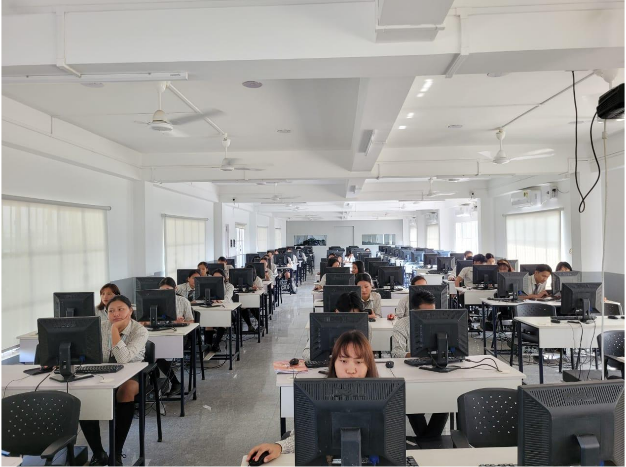
An ongoing training programme at the Computer Resource Centre