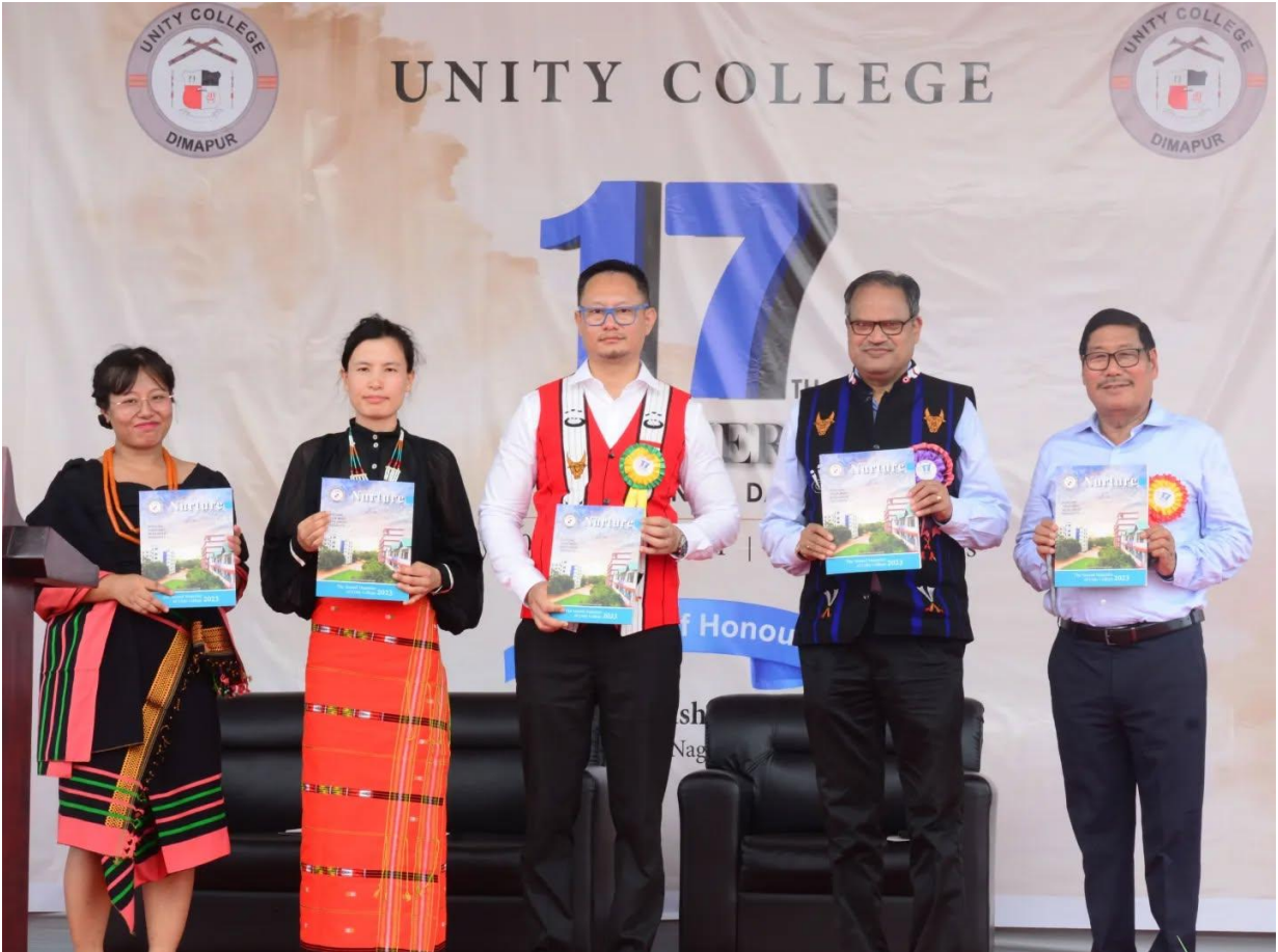
Release of the Annual College Magazine 'Nurture' 2023.