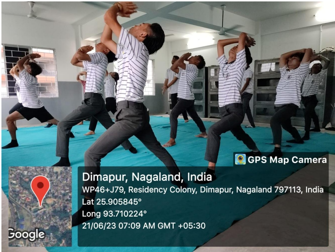
Young Indians (YI) YUVA observing the International Yoga Day on 21 st June 2023.