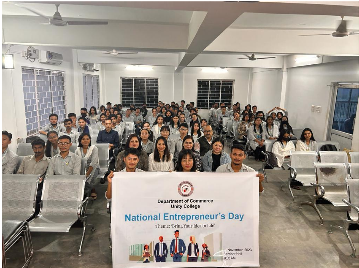
Department of Commerce celebrated the National Entrepreneurs Day 2023 under the theme, “Bring Your Idea to Life” on 21 st November 2023.