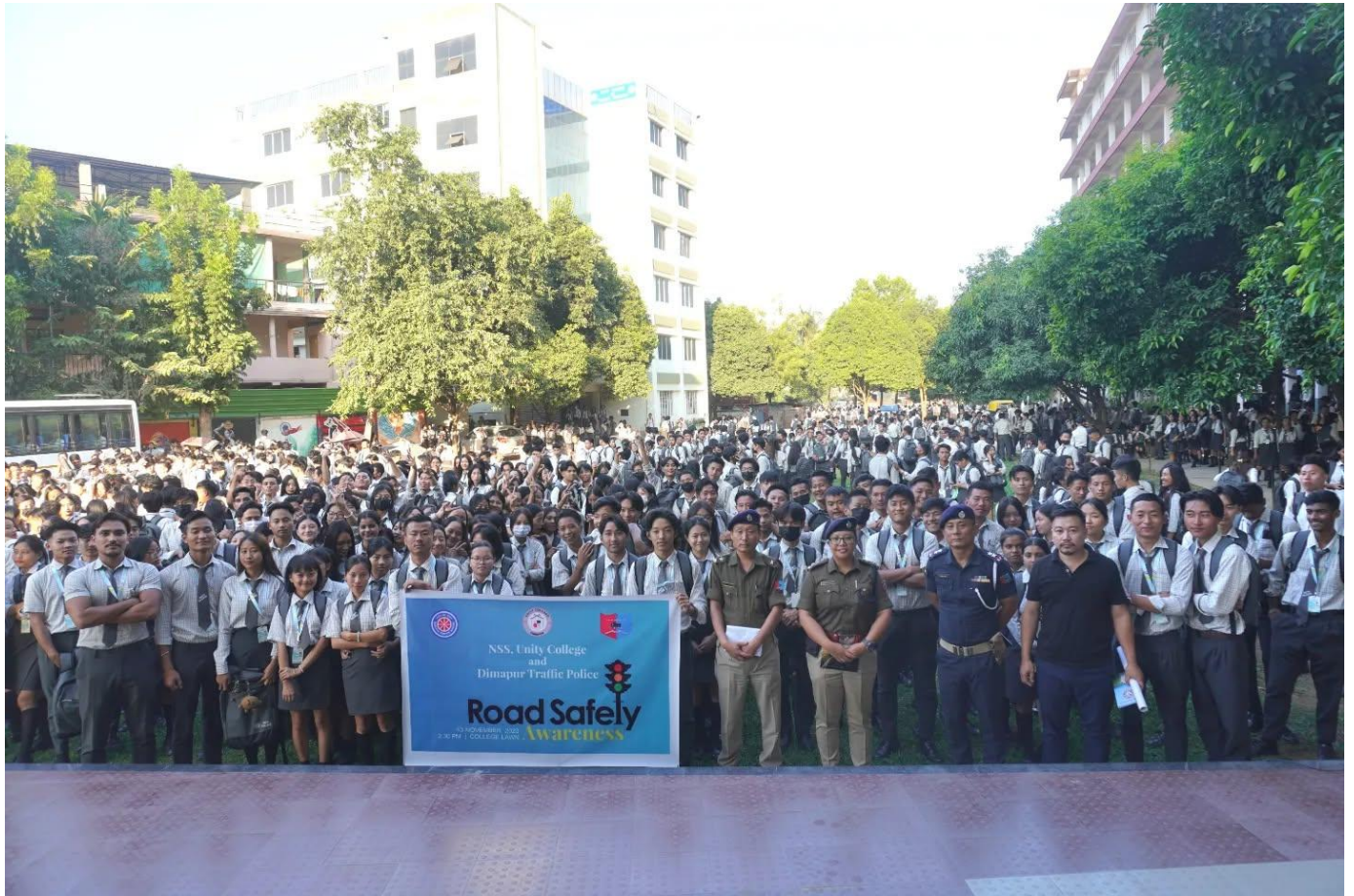
National Service Scheme (NSS) with Dimapur Traffic Police (DTP) conducted a session on Road Safety Awareness at College lawn (13 th November 2023).