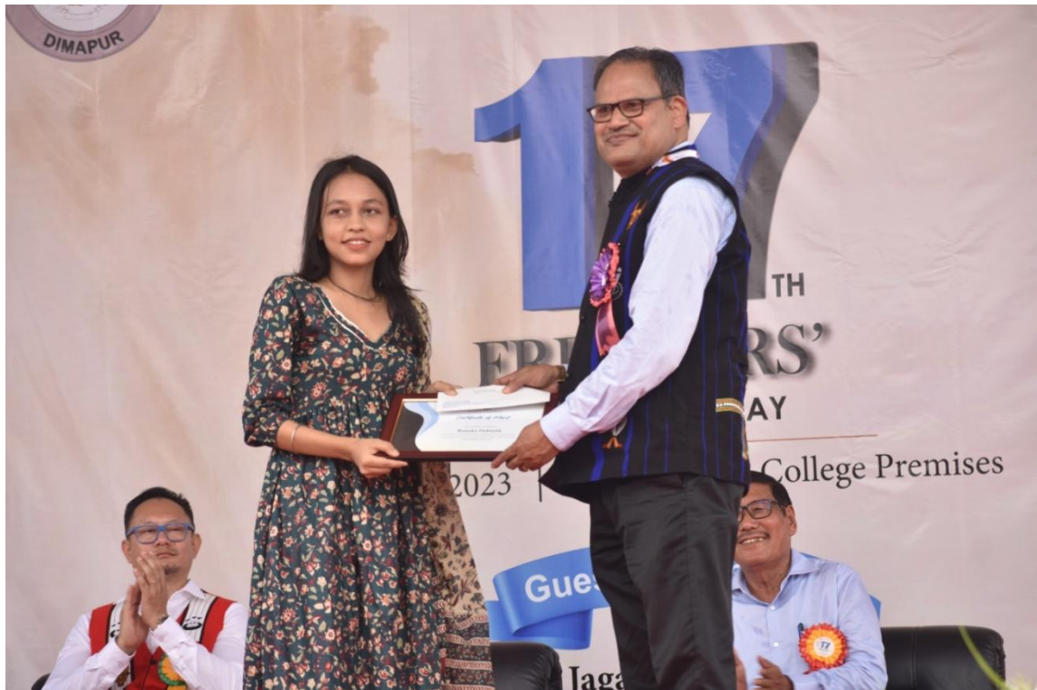
University Subject Toppers 2023