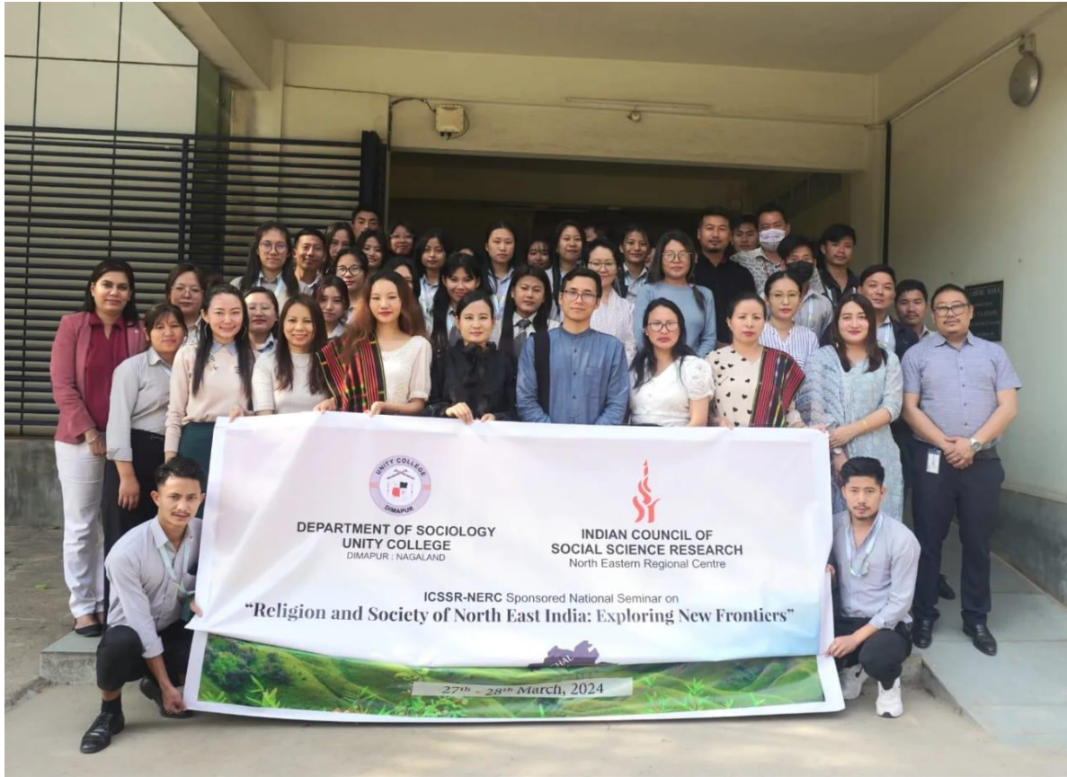
The Department of Sociology organised an ICSSR-NERC Sponsored Two-Day National Seminar on the theme ' Religion and Society of North East India: Exploring New Frontiers ' (27th- 28th March 2024).