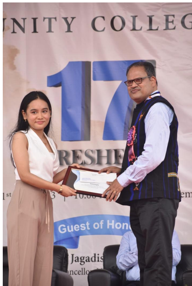
University Subject Toppers 2023