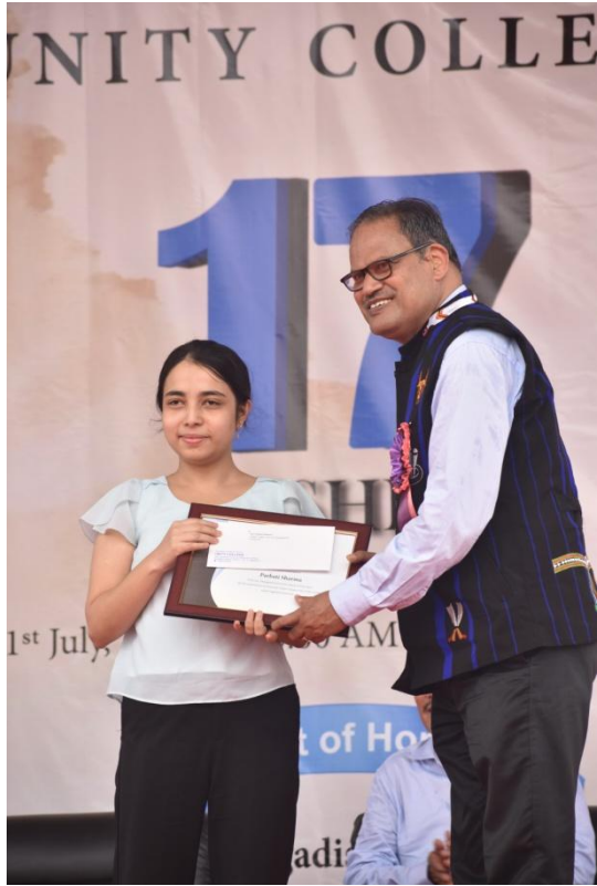
University Subject Toppers 2023