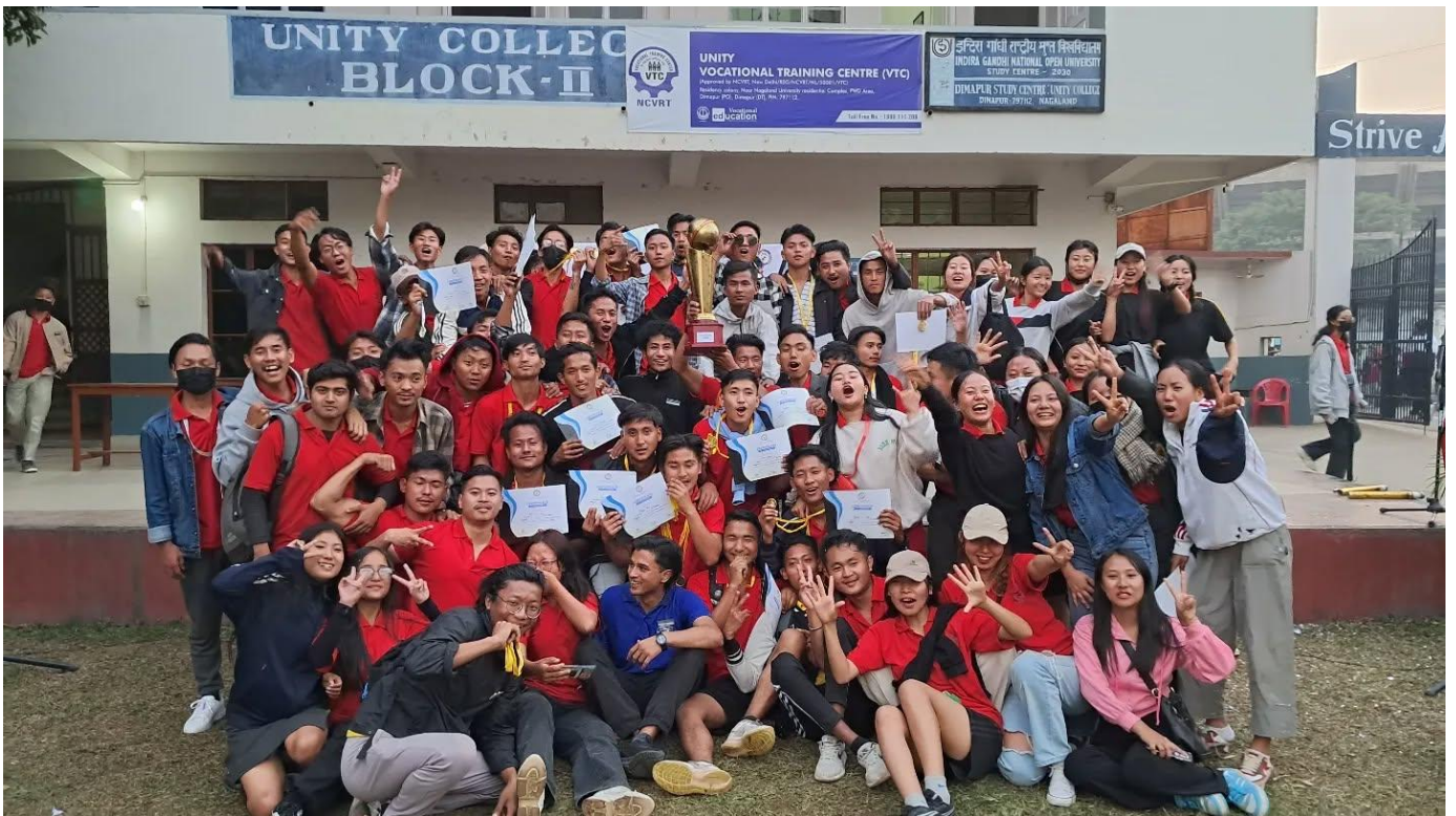
Annual Sports Meet: WINDSOR: Overall Champion of the Annual Sports Meet 2024